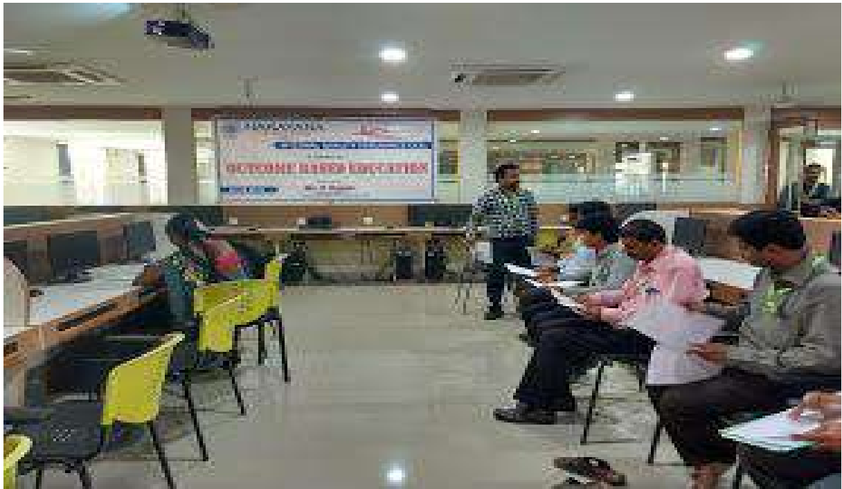
Seminar on Outcome Based education on 03-09-16