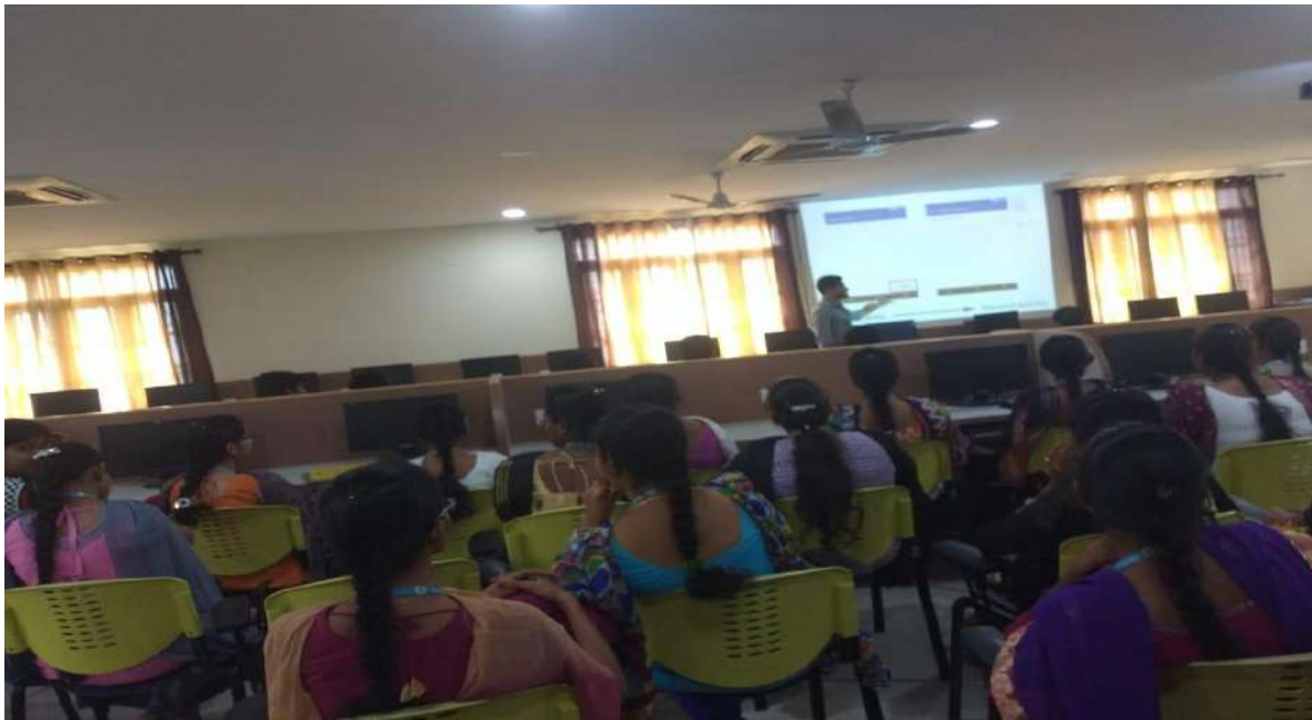
Workshop on E-Learning on 22-10-17