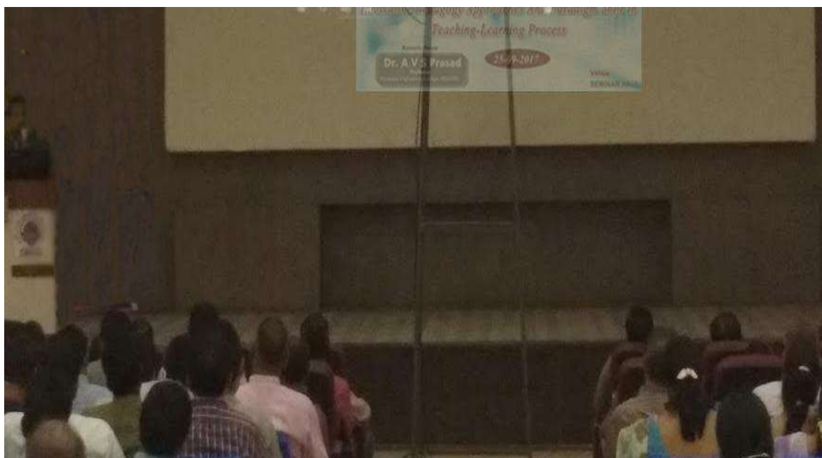
Innovative Pedagogy Approaches and Paradigm Shift in Teaching-Learning Process on 25-09-17