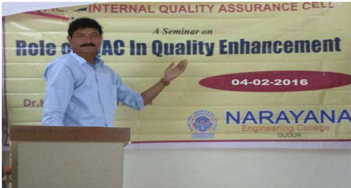
Seminar on Role of IQAC in Quality Enhancement on 04-02-16