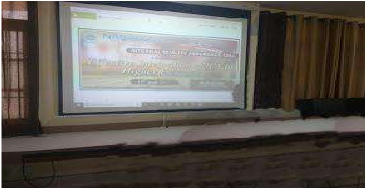
Seminar on Effective Integration of ICT in Higher Education on 15-04-17