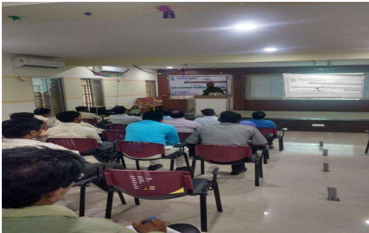
Seminar on Active Learning in Teaching- Learning Process on 27-08-16