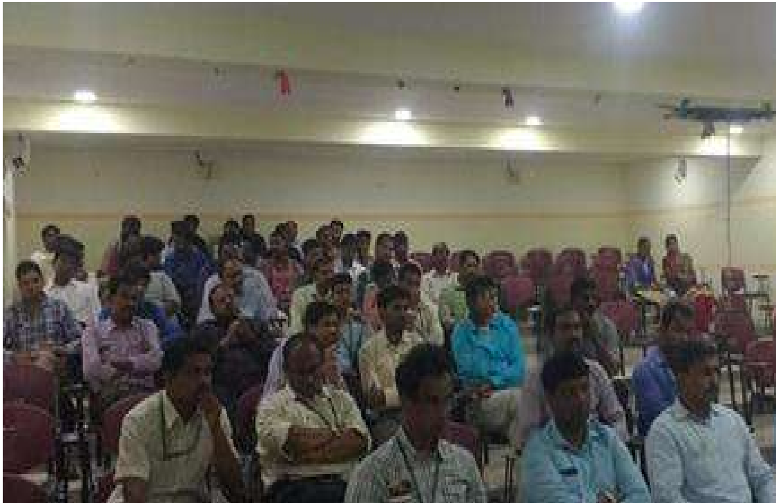
Workshop on NAAC Criteria and Online Submission on 20-04-18