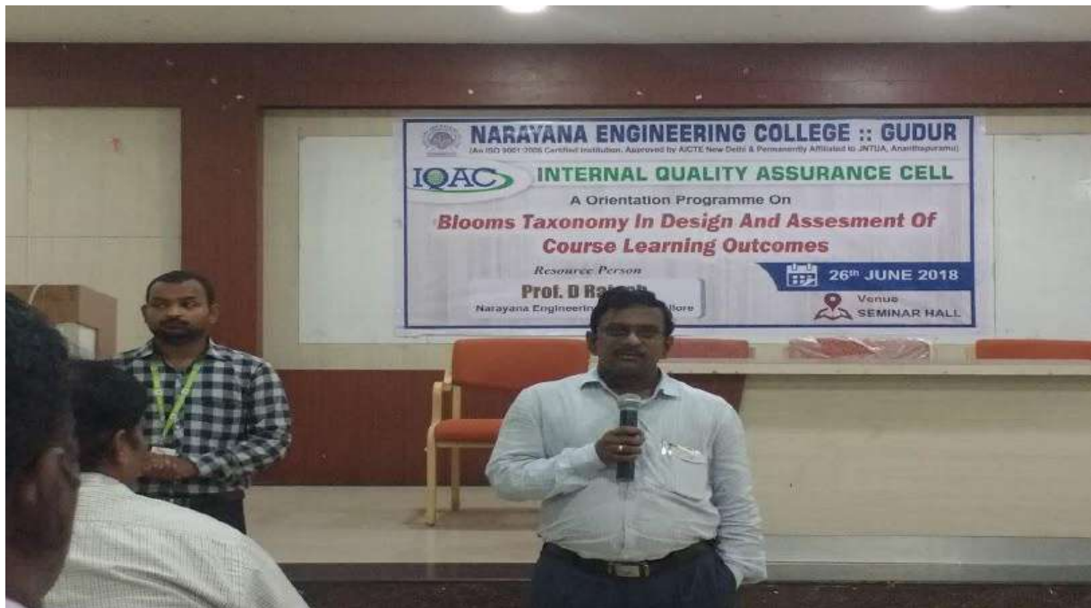
Orientation program on Bloom's Taxonomy In Design and Assessment Of Course Learning Outcomes on 26-06-2018