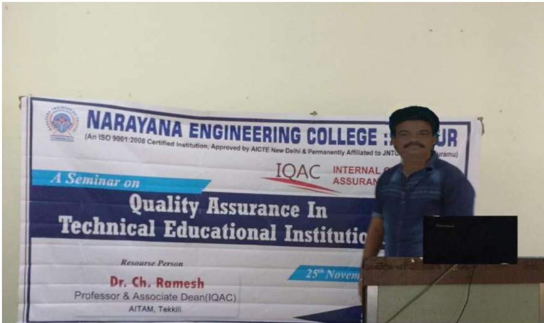
Seminar on Quality Assurance In Technical Educational Institutions on 25-11-17