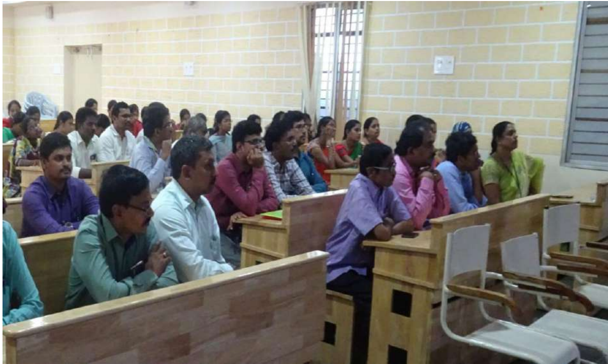
Workshop on ICT in Teaching-Learning Pedagogy on 25-03-16