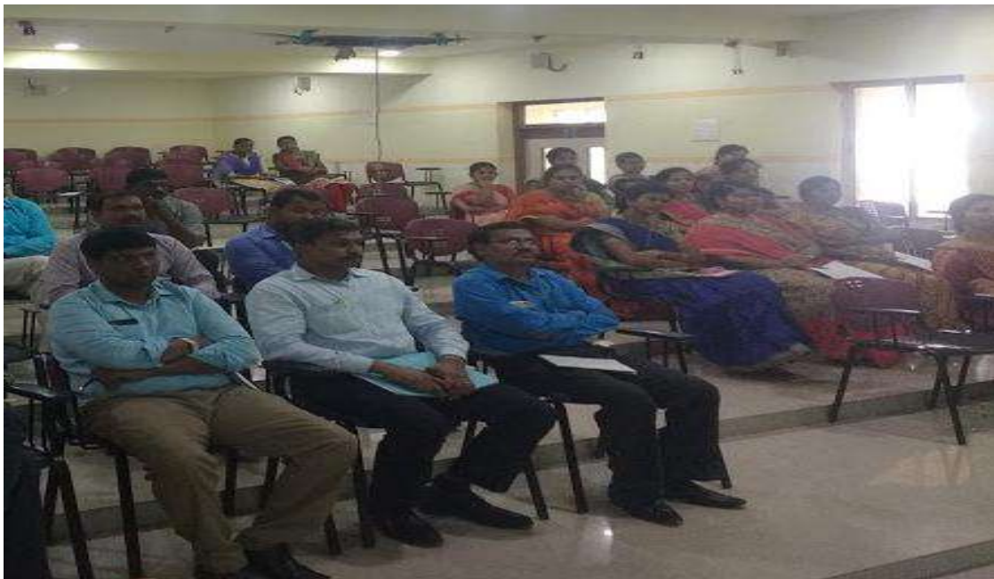
Two Day Workshop On “Attainment of Program Outcomes Through Course Outcomes for Outcome Based Education” from 27-06-18 to 28-06-18